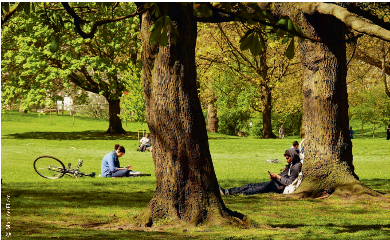
FIGURE 2: Nature-based solution approaches can promote the development and management of urban ecosystems to offer sustainable and cost-effective solutions to societal challenges like global warming, water regulation and human health, while enhancing biodiversity. Here, the Green Park in London.