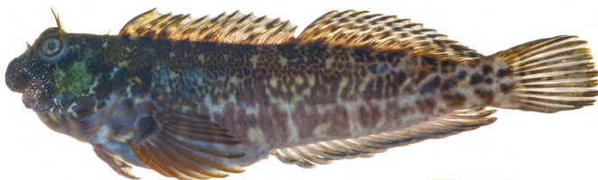
Figure 14. From top to bottom: Entomacrodus corneliae (40 mm SL), E. macropsilus (19 mm SL), E. randalli (109 mm SL).