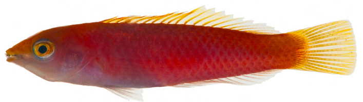
Figure 11. Pseudojuloides pyrius (32 mm SL).