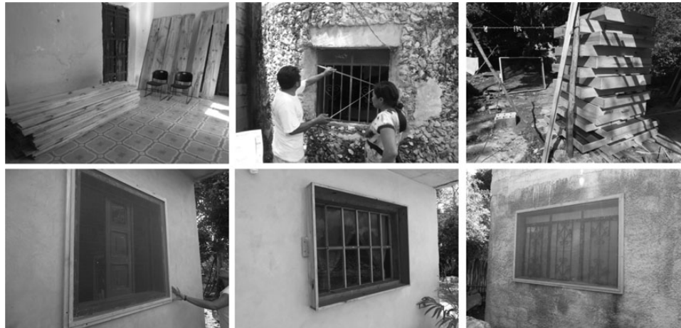
Figure 3. Manufacture and installation of insect screens for vector control. All screens were manufactured locally in the communities, using a high-quality fiber mesh with a wooden frame fitted to each bedroom window.

local situations and bypass obstacles. For example, community participation was limited in Sudzal following political tensions during local elections, as the project was perceived to be too strongly linked to the local government. Therefore we had to relocate community meetings in schools and the local health center to emphasize the non-political nature of the vector control intervention. Local governments were very supportive of the interventions, which they have readily incorporated as part of their social programs for housing improvement. For example, in Teya the mayor has agreed to fund the installation of extra window screens to large families who have additional bedrooms not covered by the project. Similarly, in Sudzal the mayor has agreed to provide