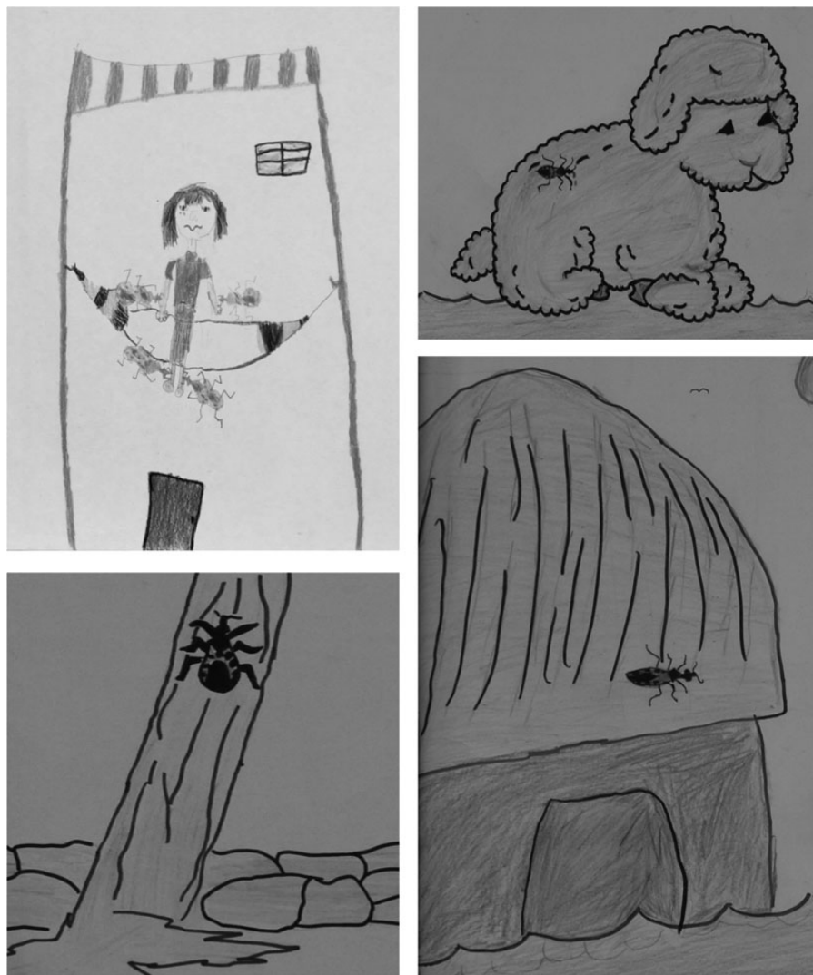
Figure 1. Children's perception of triatomines through drawings. Children appeared very knowledgeable about triatomines and their feeding habits, and should be engaged in education and awareness campaigns about Chagas disease and vector control.

of the different stakeholders about the intervention, and evaluating potential changes in their awareness of triatomines and Chagas disease and in their perception of the concept of vector control.